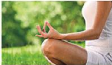
Meditation, spa and yoga