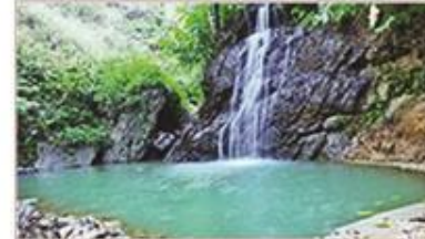
leisure walks to the water fall.